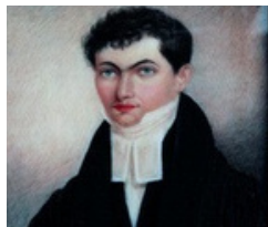
Gershom Mendes Seixas (1745-1816), the first American-born spiritual leader of Shearith Israel and a strong advocate for American independence.