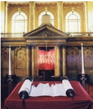
Revolutionary War Torah Scrolls from Congregation Shearith Israel, desecrated in 1776 when British forces took possession of New York City

On January 12, 2025 at 2pm, the outstanding documentary, " From Inquisition to Religious Freedom: The Story of Jews and the U.S. Constitution ," featuring legal scholar and historian, Dr. Isaac Amon, will be shown at First Congregational Church UCC, 608 W Fourth Street, Waterloo IA 50702.