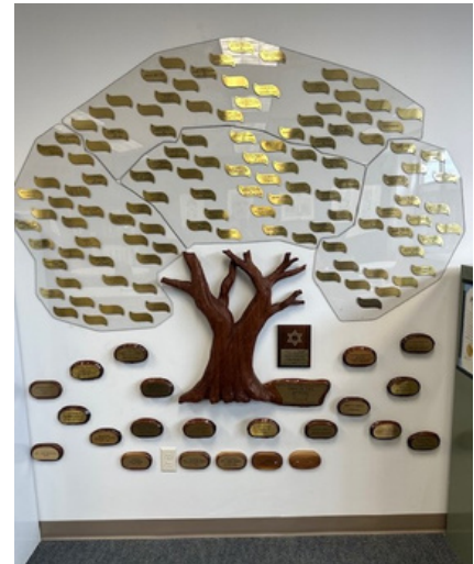
SOJ Tree of Life Plaque at our current location

Although my Dad was a small businessman, he had a tremendous background as well as a willingness to work and a love of Judaism. While attending East Waterloo High, he worked at Gramp's clothing store and participated in symphony, camera club, gymnastics, and wood working. At Iowa State Teachers College, now the University of Northern Iowa, he majored in physics and participated in Civil Pilot Training Program, being certified as a pilot.